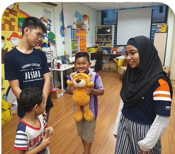
Community service - Orphanage visit

If a student is found to be too far behind in the syllabus and unable to catch up due to lack of attitude/aptitude then he/she will be counselled to drop a subject. If two or more lecturers agree he/she lacks the ability to cope, after the mid-semester report, he/she will be counselled and further action will be recommended accordingly.