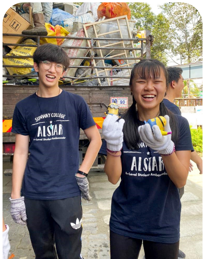
Community service - Recycling

There are many extracurricular activities available to all students in the institution. These activities are usually held during the weekdays, but may occasionally be scheduled over weekends and public holidays. Students are encouraged to participate in extracurricular activity as it provides a more wholesome development. It may also enhance a reference or testimonial.