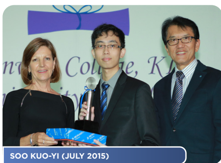
SOO KUO-YI (JULY 2015)