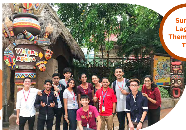
Sunway Lagoon Theme Park Trip