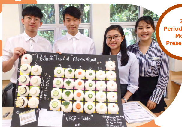
3D Periodic Table Model Presentation