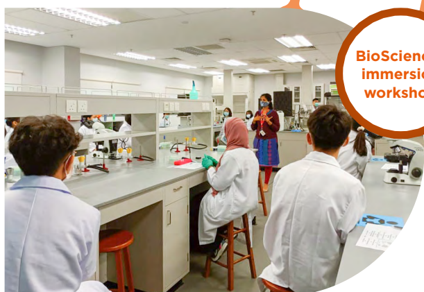
BioSciences immersion workshop