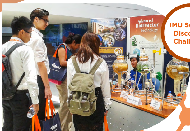
IMU Science Discovery Challenge