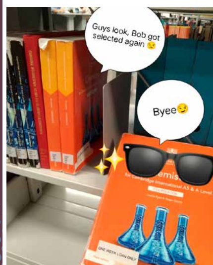
Wong Ann-Chi Cambridge GCE A-Level